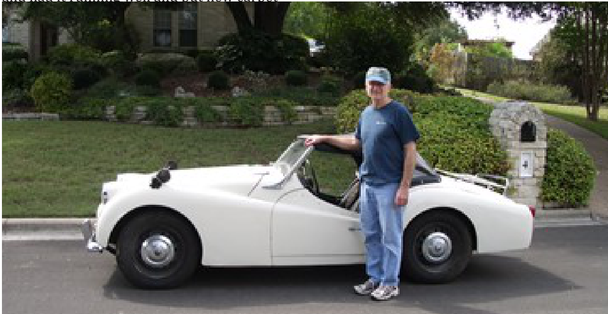
1960 TR3A ready to load on transport truck going to Georgia.

Years passed without a Triumph in the family. I had noticed a TR3 in a garage in my hometown in Arkansas a couple of times when visiting my Dad. In 2004 I knocked on