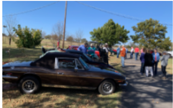
Pilcher farm lineup.