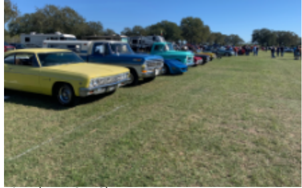
Kingsbury Car Show.