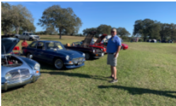
British cars too.

The drive to Rudy's BBQ on the ninth was pleasant and we enjoyed the barbecue and beer. The TR4 ran well and to my relief, all the lights worked on the way home. I was now comfortable with the car's reliability and drove it to Waterloo Ice House the following Saturday morning. After the meeting, several of us motored down to Kingsbury for the car show and fly-in. The scenic back-way turned out to be quite the obstacle course, with road traffic, road closings, train traffic and the like. It was nevertheless a beautiful day for a road trip and we had just enough time to make the rounds at the Pioneer Air Museum grounds. On the way home, we stopped at Black's BBQ in San Marcos for a late lunch, then a quickie at the Barber Shop in Drippin'.